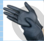
Black Nitrile Glove