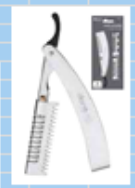
Hair Shaper Razor