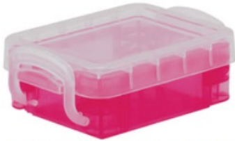
INI STACKING Storage Boxes with Lids 2.4" x 3.2" x 1.3" (6cm x 8.3cm x 3.3cm)