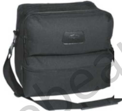
Nursing Supply Bag, Latex Free Dimension : 13" x 12" x 7", Color: Black