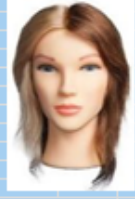
Hilary QUAD Color Mannequin