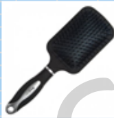
9 row ball tip Paddle Brush