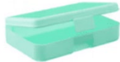
TEAL Plastic Storage box with Hinged Lid DIMENSION: 7.9" x 5.4" x 2.0"