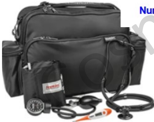
Vital Signs Starter Kit