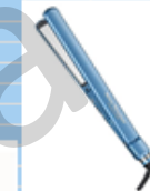
Babyliss 1" Ultra Thin Straightening Iron