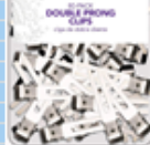
80 slide in double prong clip