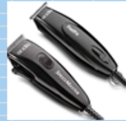
André COMBO Pivot PRO and Speedmaster Clipper