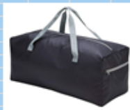
Mannequin tote bag (Foldable Duffel Bag 30" x 75L) Lightweight with Water Resistant for Travel