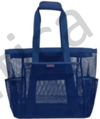
Nursing Mesh Utility Tote Bag Dimensions: 22" x 14" x 7.5"