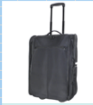
City Lighter Studio PRO Black Tote ROLLING Duffel Bag on Wheels